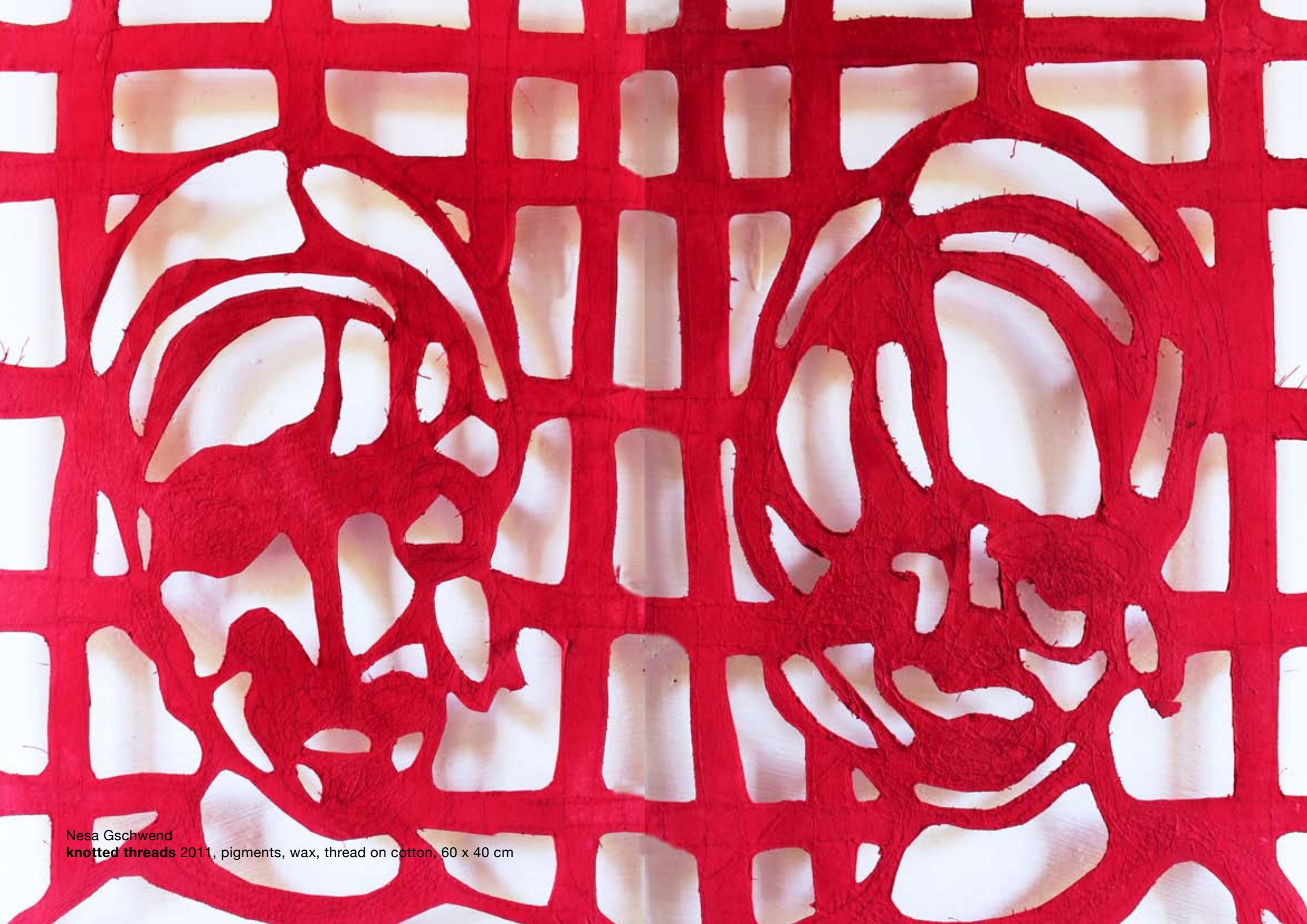
Nesa Gschwend knotted threads 2011, pigments, wax, thread on cotton, 60 x 40 cm